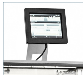
5.7" color touch screen with S.On software for intuitive navigation and library based programming