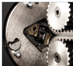
High precise rotary incision unit based on industry leading Schleuniger technology