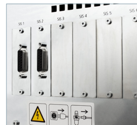
Modularly designed interfaces for full range of accessories, including prefeeders, marking systems, coilers, stackers and custom devices