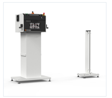
PreFeeder 3200 with Loop Limit Control

The PreFeeder 3200 is a free-standing, prefeeding machine designed to feed wire and cable from reels, providing a constant tension to downstream wire processing machines. It is available in two different configurations. For smaller diameters and more flexible cables, the PreFeeder 3200 can be configured with the Accumulator Speed Control to sense downstream demand and control the feeding speed. For larger diameters and stiffer cables, the PreFeeder 3200 can be configured with the Loop Limit Control which features integrated speed synchronization with Schleuniger Cut & Strip machines. The optional Inlet Accumulator reduces tensile stress on the cable during reel acceleration and absorbs cable slack when the PreFeeder 3200 is decelerating.